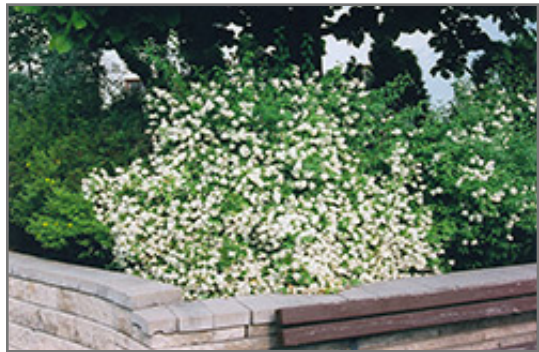
Galahad Mockorange in bloom