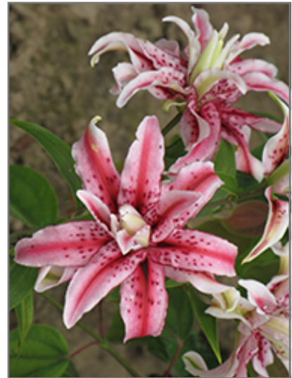
Magic Star Lily flowers