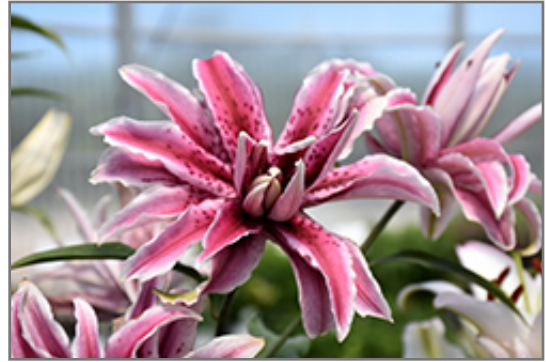
Magic Star Lily flowers