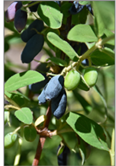
Cinderella Honeyberry fruit

This is a dense multi-stemmed deciduous shrub with a more or less rounded form. Its average texture blends into the landscape, but can be balanced by one or two finer or coarser trees or shrubs for an effective composition. This plant will require occasional maintenance and upkeep, and is best pruned in late winter once the threat of extreme cold has passed. It is a good choice for attracting butterflies to your yard. It has no significant negative characteristics.