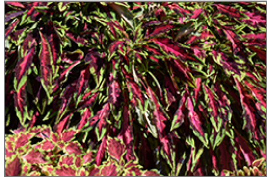
Spitfire Coleus foliage