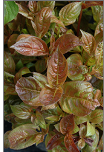
Wings Of Fire Weigela foliage

Gardener's Challenge Plant Regular Warranty Does Not Apply