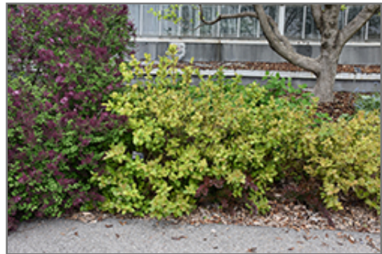
Wings Of Fire Weigela