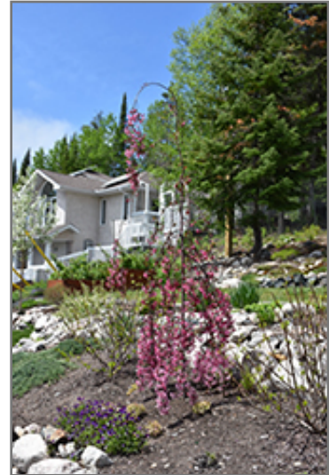
Royal Beauty Flowering Crab in bloom

This shrub should only be grown in full sunlight. It prefers to grow in average to moist conditions, and shouldn't be allowed to dry out. It is not particular as to soil type or pH. It is highly tolerant of urban pollution and will even thrive in inner city environments. This particular variety is an interspecific hybrid.