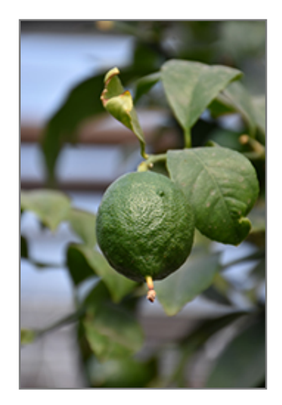
Persian Lime fruit

Persian Lime features showy clusters of fragrant white star-shaped flowers with yellow eyes at the ends of the branches from late winter to early spring. It has attractive dark green evergreen foliage. The glossy oval leaves are highly ornamental and remain dark green throughout the winter. It features an abundance of magnificent green berries in mid summer.