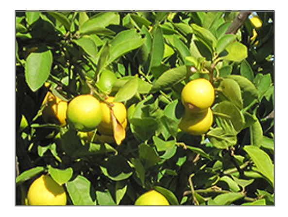
Persian Lime fruit

1818 Central Avenue Saskatoon, SK S7N 2Z9 (306) 249-1222 www.dutchgrowers.com