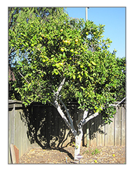
Persian Lime