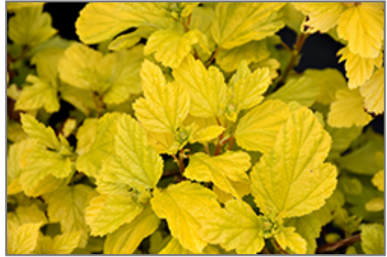
Festivus Gold Ninebark foliage

This shrub does best in full sun to partial shade. It is very adaptable to both dry and moist locations, and should do just fine under average home landscape conditions. It is not particular as to soil type or pH. It is highly tolerant of urban pollution and will even thrive in inner city environments. This is a selection of a native North American species.