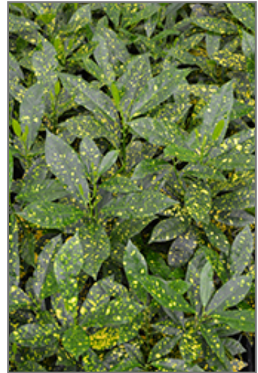
Gold Dust Variegated Croton foliage