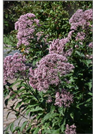
Joe Pye Weed flowers

Joe Pye Weed is an herbaceous perennial with an upright spreading habit of growth. Its wonderfully bold, coarse texture can be very effective in a balanced garden composition.