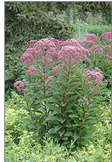
Joe Pye Weed in bloom