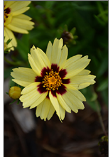
UpTick Cream and Red Tickseed flowers

UpTick Cream and Red Tickseed is recommended for the following landscape applications;