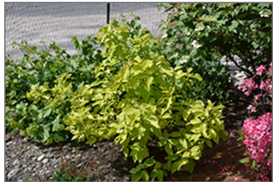
Neon Burst Dogwood