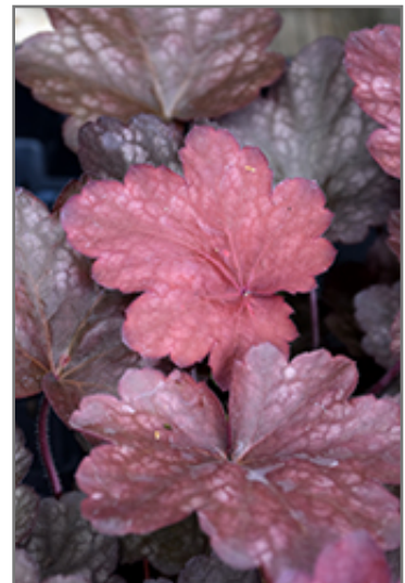
Carnival Candy Apple Coral Bells foliage