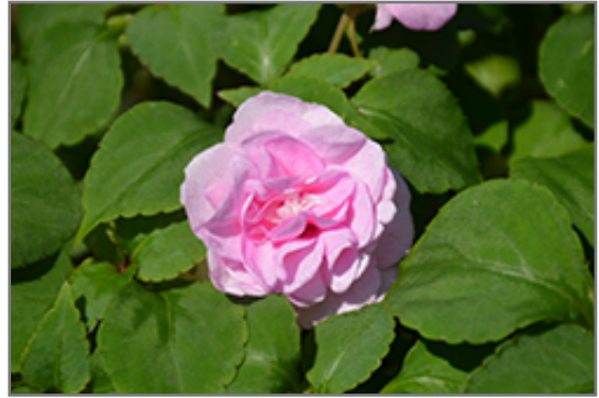
Rockapulco Orchid Impatiens flowers

Rockapulco Orchid Impatiens is recommended for the following landscape applications;