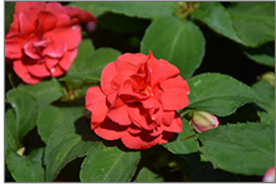
Rockapulco Red Impatiens flowers

Rockapulco Red Impatiens is recommended for the following landscape applications;