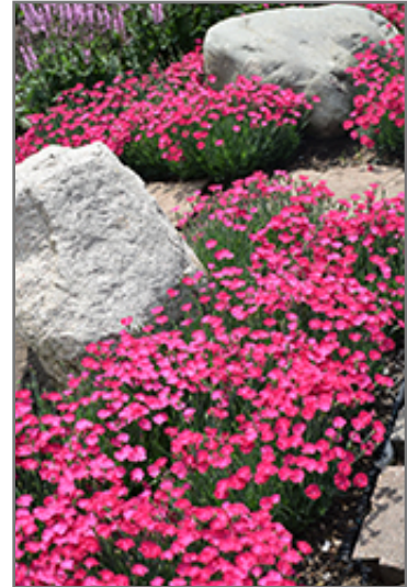
Paint The Town Magenta Pinks in bloom

Paint The Town Magenta Pinks is an herbaceous evergreen perennial with a mounded form. It brings an extremely fine and delicate texture to the garden composition and should be used to full effect.