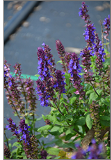
New Dimension Blue Sage flowers

New Dimension Blue Sage is recommended for the following landscape applications;