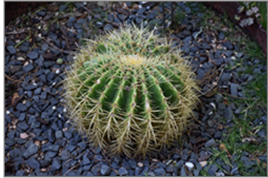
Golden Barrel Cactus

Golden Barrel Cactus is a succulent evergreen plant. It is a member of the cactus family, which are grown primarily for their characteristic shapes, their interesting features and textures, and their high tolerance for hot, dry growing environments. Like all cacti, it doesn't actually have leaves, but rather modified succulent stems that comprise the bulk of the plant, and which are designed to hold water for long periods of time. This particular cactus is valued for its distinctive barrel shape, and usually grows as a single spiny ribbed green stem. This plant has yellow cup-shaped flowers held atop the stems from late spring to early summer, which are interesting on close inspection.