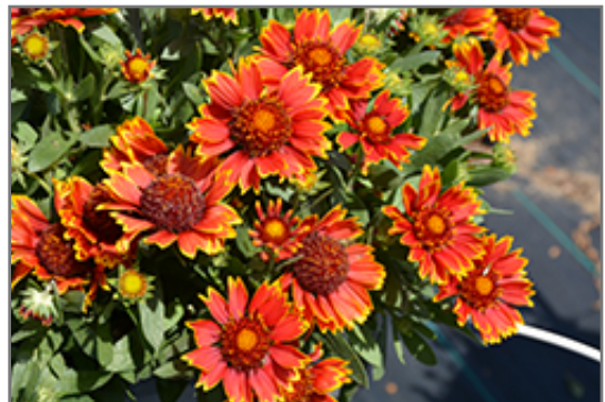
SpinTop Orange Halo Blanket Flower flowers