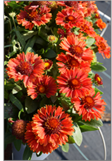
SpinTop Yellow Touch Blanket Flower flowers

SpinTop Yellow Touch Blanket Flower is a dense herbaceous perennial with a mounded form. Its relatively fine texture sets it apart from other garden plants with less refined foliage.