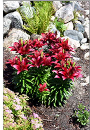
Lily Looks Tiny Rocket Lily in bloom