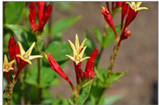
Little Redhead Indian Pink flowers