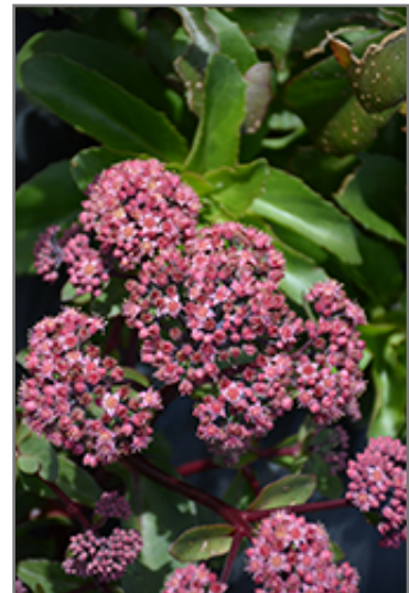
Double Martini Stonecrop flowers