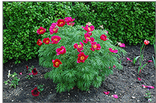
Fernleaf Peony in bloom