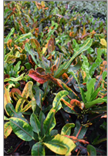
Mammy Croton in full

This is a dense herbaceous evergreen houseplant with an upright spreading habit of growth. Its wonderfully bold, coarse texture is quite ornamental and should be used to full effect. This plant should not require much pruning, except when necessary to keep it looking its best.