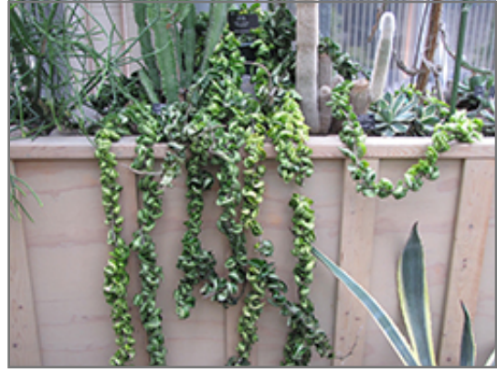
Hindu Rope Plant

When grown indoors, Hindu Rope Plant can be expected to grow to be about 12 inches tall at maturity, with a spread of 3 feet. It grows at a medium rate, and under ideal conditions can be expected to live for approximately 10 years. This houseplant should be situated in a location that gets indirect sunlight at most, although it will usually require a more brightly-lit environment than what artificial indoor lighting alone can provide. It is very adaptable to both dry and moist soil, but will not tolerate any standing water. The surface of the soil shouldn't be allowed to dry out completely, and so you should expect to water this plant once and possibly even twice each week. Be aware that your particular watering schedule may vary depending on its location in the room, the pot size, plant size and other conditions; if in doubt, ask one of our experts in the store for advice. It is particular about its soil conditions, with a strong preference for rich, acidic soil. Contact the store for specific recommendations on pre-mixed potting soil for this plant.