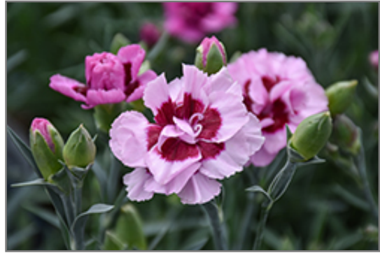
Pretty Poppers Kiss And Tell Pinks flowers

Pretty Poppers Kiss And Tell Pinks is recommended for the following landscape applications;