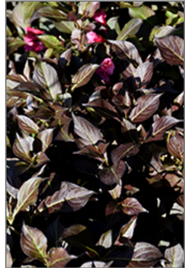
Midnight Wine Shine Weigela foliage