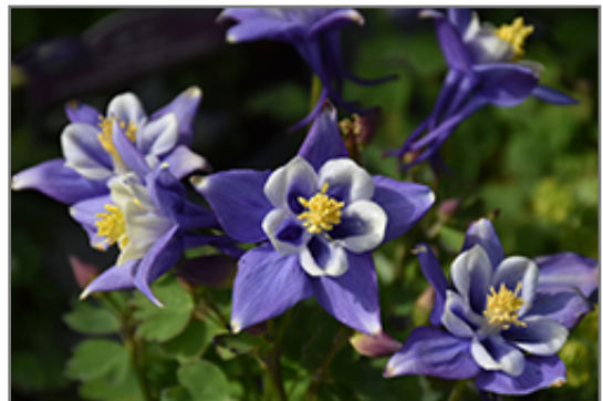
Earlybird Blue and White Columbine flowers