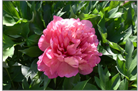
Hillary Peony flowers