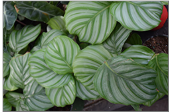
Color Full Orbifolia Prayer Plant foliage