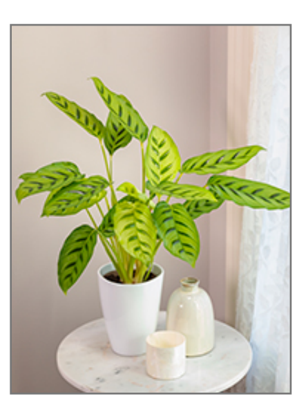
Color Full Leopardina Shadow Plant in full

1818 Central Avenue Saskatoon, SK S7N 2Z9 (306) 249-1222 www.dutchgrowers.com