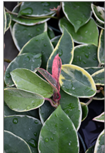
Krimson Queen Wax Plant foliage