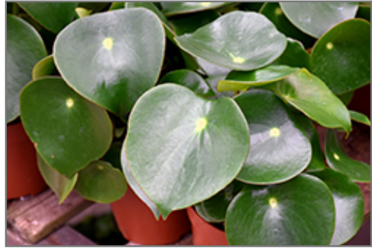
Raindrop Peperomia foliage

Other Names: Coin Leaf Peperomia, Chinese Money Plant