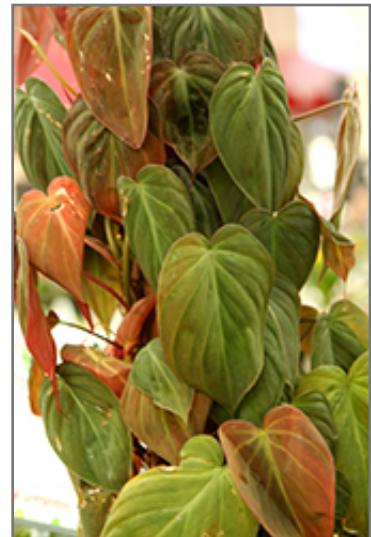
Velvet Leaf Philodendron foliage