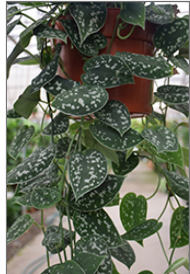
Argyraeus Pothos foliage