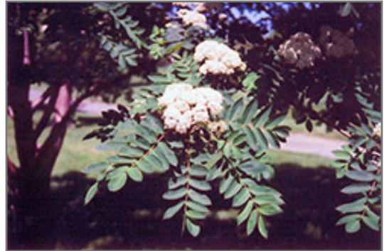
Showy Mountain Ash flowers

This tree should only be grown in full sunlight. It is very adaptable to both dry and moist locations, and should do just fine under average home landscape conditions. It is not particular as to soil type or pH. It is highly tolerant of urban pollution and will even thrive in inner city environments. This species is native to parts of North America.