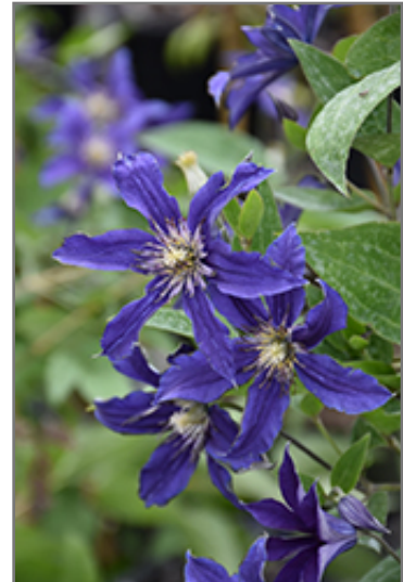
Sapphire Indigo Clematis flowers