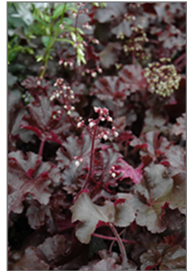
Melting Fire Coral Bells flowers

Gardener's Challenge Plant Regular Warranty Does Not Apply