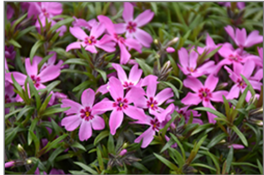
Crimson Beauty Moss Phlox flowers