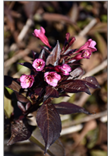
Fine Wine Weigela flowers