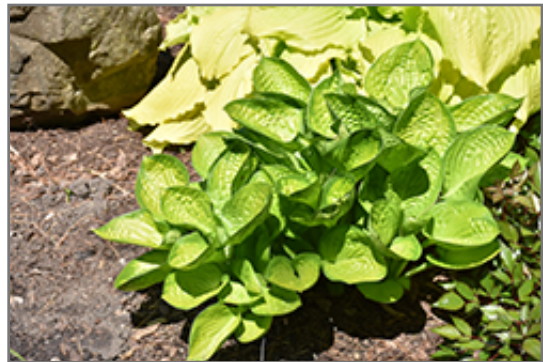
Rainforest Sunrise Hosta