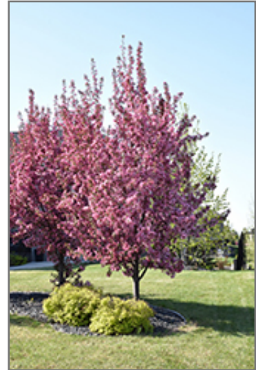
Pink Spires Flowering Crab in bloom

Pink Spires Flowering Crab is recommended for the following landscape applications;